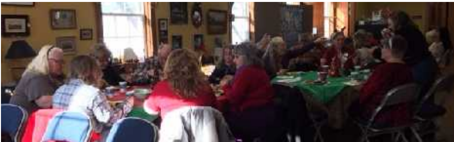
COA Christmas Luncheon diners enjoyed good food and good company.