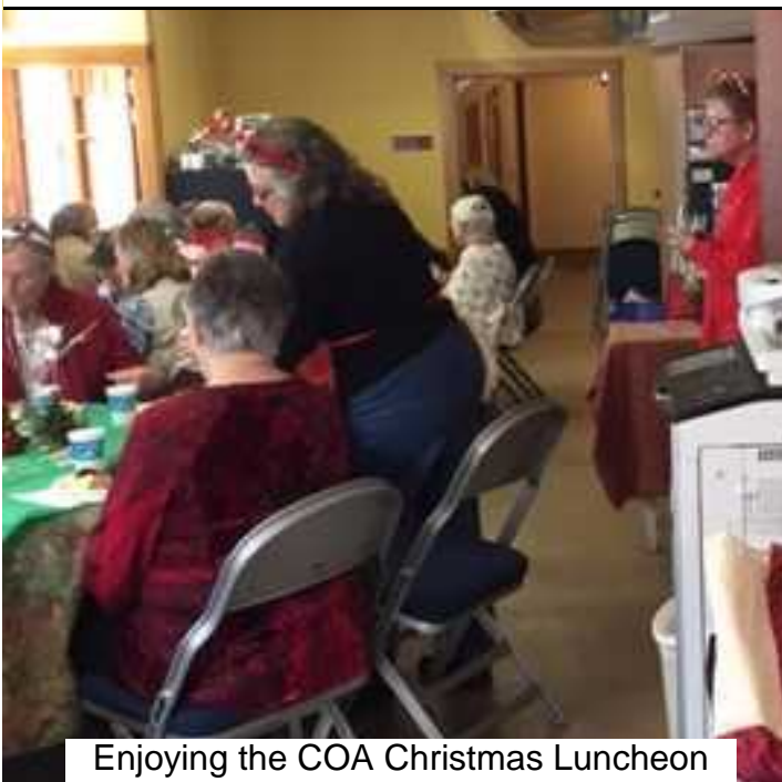
Enjoying the COA Christmas Luncheon