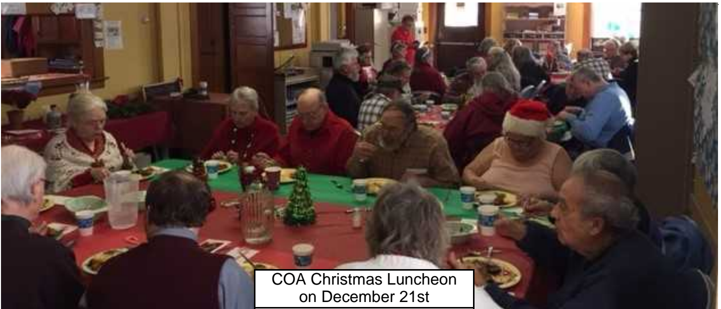
COA Christmas Luncheon on December 21st