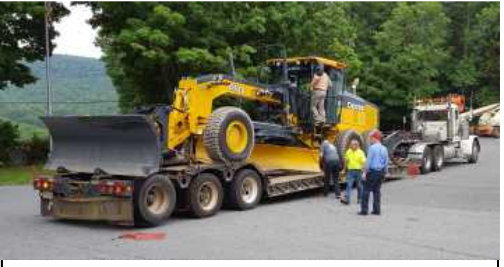
New road grader ready to be unloaded.

All offices will be an extension of the main number. You will be directed to press numbers for the offices as follows: for the Selectboard and Municipal Assistant, press 1; for the Assessors, press 2; for the Town Clerk, press 3; for the Tax Collector, press 4. This is for Town Hall offices only. Police, Fire, and Highway remain the same. -Bob Hardesty