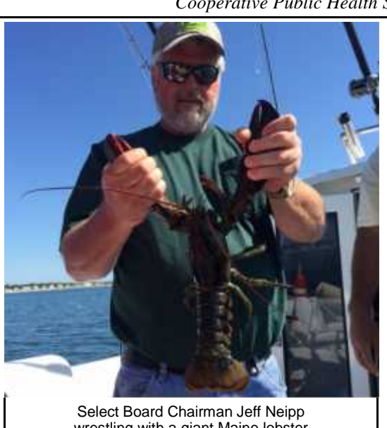
wrestling with a giant Maine lobster

Public Health Nurse Franklin Regional Council of Governments Cooperative Public Health Service