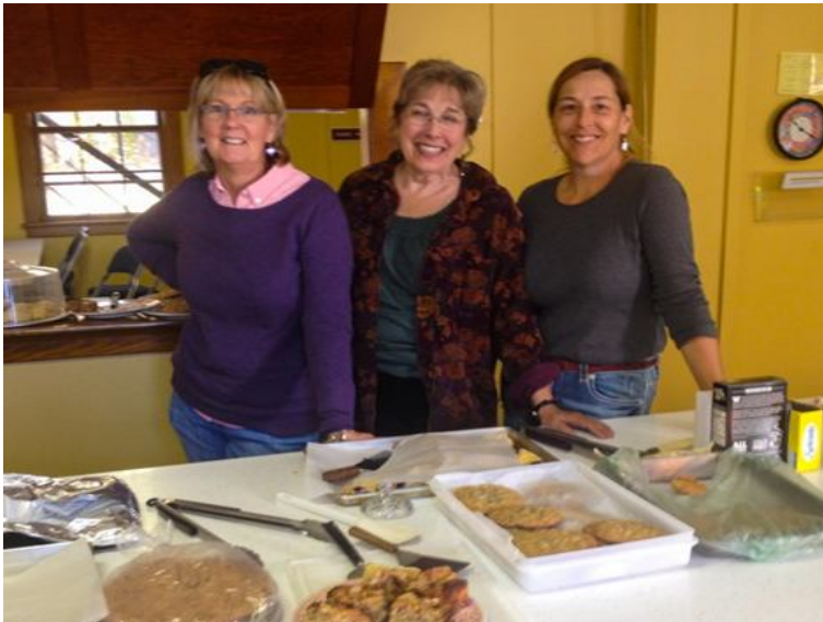
Leyden Café Opening In the kitchen and enjoying good company