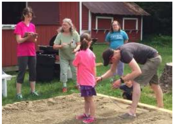
Who jumped the longest distance?