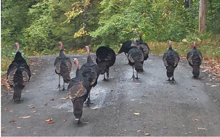
Alexander Rd. Traffic Jam