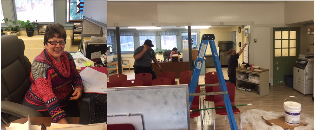
Inside the town municipal building.