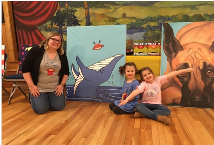
Having fun at the Author's Night.